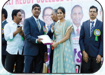
Best in Academics